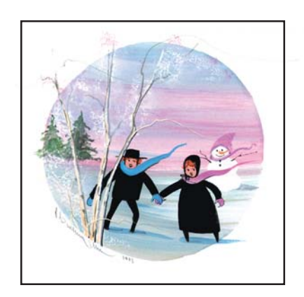
"Warm Hearts" Seventh Junior Members-Only Print