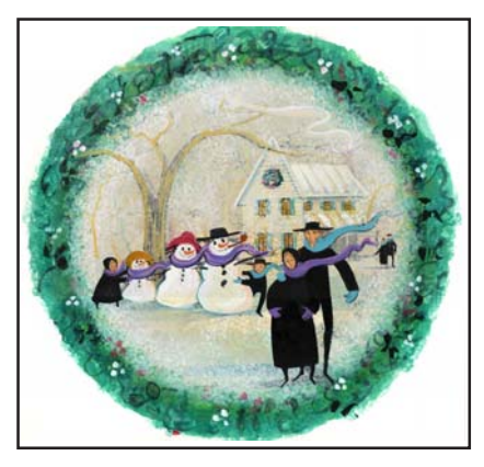
"Seasons of Love, Winter" Twentieth Members-Only Print