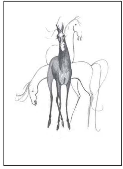
2006 Renewal Gift "Eternal Spirit"

ship brooch, but the company no longer provides the shipping to members. All the fulfillment items are now stored at the office. At designated times, McClung Companies, which has printed the Sentinel for many years, will print