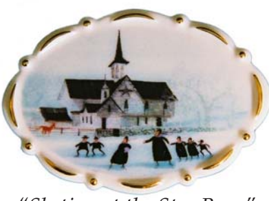
"Skating at the Star Barn" membership brooch

accepted to an accredited four-year college or university or a twoyear community college. Financial need