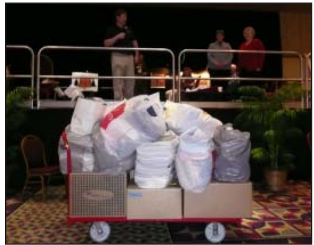
Just some of the 283 bath towels collected for the Four Oaks facility.