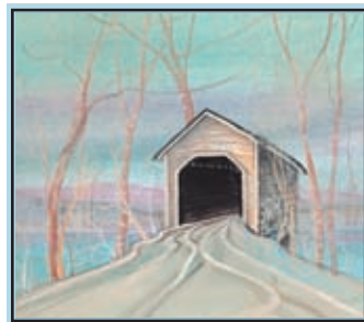
2011 Adult MOP The Sheltered Way

3. New Members-Only Print: This year's print is in fact two prints and a complimentary matching third print if you are a chapter member. In response to many of you who comment that you have no more space on your walls for prints, our members-only "print" for 2011 members will be two matching miniature giclées, measuring just 4" x 4½" each. These are small enough to be framed and hung in small spaces or displayed on a table-top stand.