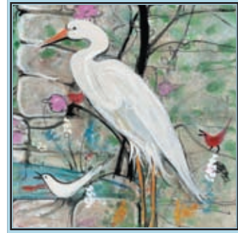
Angel in My Garden Plaque, $15 2010 Plaque