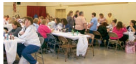
Lake Marburg Moss Chapter's very successful Vera Bradley Bingo.

This chapter was formed in October, 1989, and members have raised a total of $106,278.30 for various charities, on both the local and national levels. They currently have 105 chapter members and continue to grow.