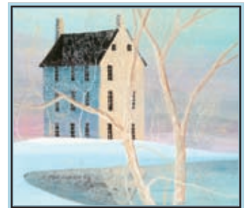
2011 Adult MOP Journey's Reward