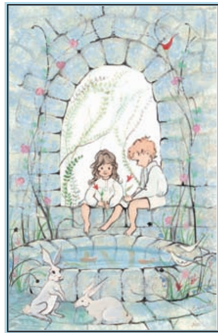
Precious Angels in My Garden, $55 2010 Junior Members-Only Print