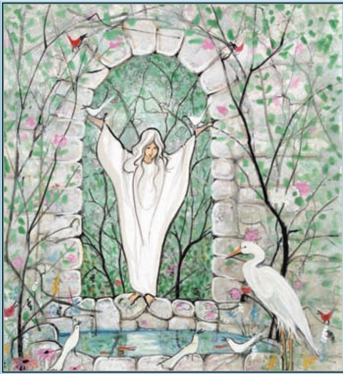
Angel in My Garden, $75 2010 Adult Members-Only Print

Remember that you received your redemption certificate again on the same piece of paper as your membership card. You will NOT be receiving a certificate in a separate mailing. Some of you may already have redeemed your print since you could do so as soon as you received your certificate. If you have not yet redeemed yours, please follow the directions below.