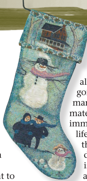
Snowman Stocking $40

In reality, the snowman's existence is fleeting; we