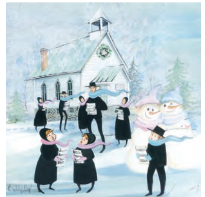
The Caroling Season $110 Offset Lithograph IS: 12-5/16 x 12-3/8 ins. Edition 1,000 and 25 artist's proofs