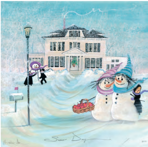
Snow Day $110 Offset Lithograph IS: 12-1/2 x 12-9/16 ins. Edition 1,000 and 25 artist's proofs