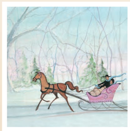
Victorian Splendor and Brightman's Sleigh Ride Set $110 per set Giclée on paper IS: 5 x 5 ins. each giclée Edition 250 and 25 artist's proofs