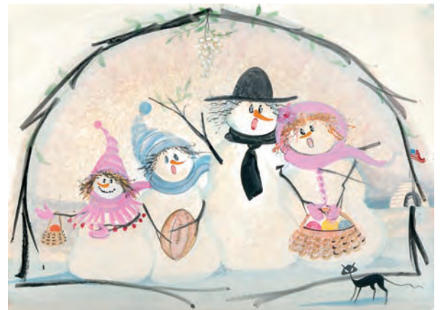
Let it Snow $80 Giclée on paper IS: 7-1/4 x 10 ins. Edition 250 and 25 artist's proofs