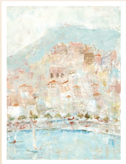
le Midi $85 Giclée on paper IS: 10-15/16 x 8-1/8 ins. Edition 250 and 25 artist's proofs