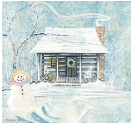
Warmth Within $75 Offset Lithograph IS: 7-1/2 x 8-1/8 ins. Edition 1,000 and 25 artist's proofs