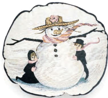
Snowman Pillow $50