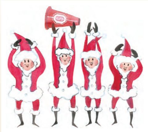
Ho! Ho! Ohio! $80 Giclée on paper IS: 8-3/4 x 9-5/8 ins.. Edition 250 and 25 artist's proofs