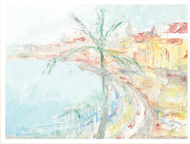
Côte d'Azur – Nice $400 Giclée on canvas IS: 14-3/4 x 20 ins. Edition 150 and 15 artist's proofs