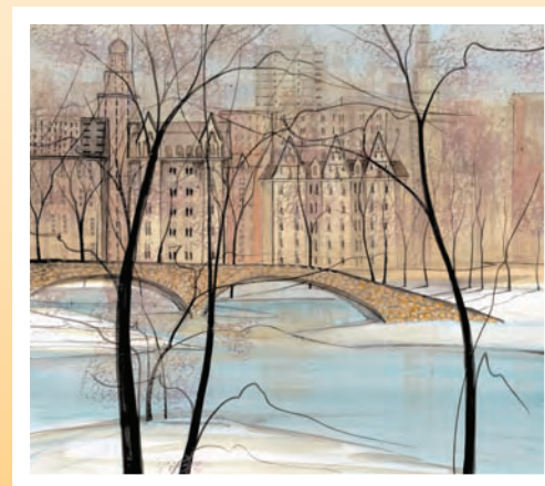
Oasis Giclée on paper Edition 250 and 25 artist's proofs