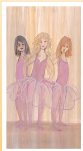
Ballerina Girls IS: 13 x 7 ins., $85 Giclée on paper Edition 250 and 25 artist's proofs