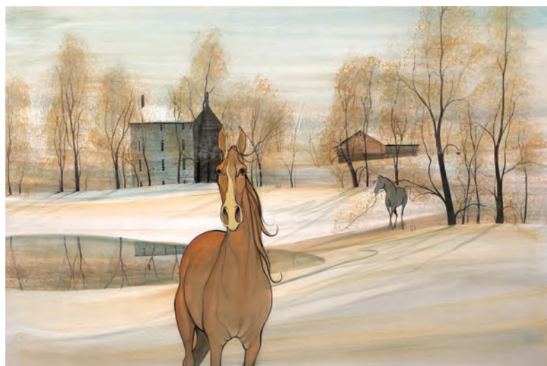
The Matriarch Giclée on paper Edition 250 and 25 artist's proofs