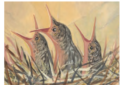
The Triplets IS: 5-7/8 x 8 ins., $65 Giclée on paper Edition: 250 and 25 artist's proofs