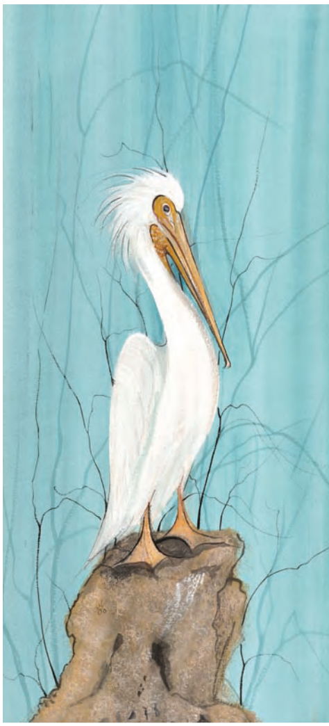
The Lookout IS: 18 x 8-5/16 ins., $120 Giclée on paper Edition: 250 and 25 artist's proofs