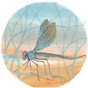
Wings of Change IS: 4 x 4 ins., $45 Giclée on paper Edition: 250 and 25 artist's proofs