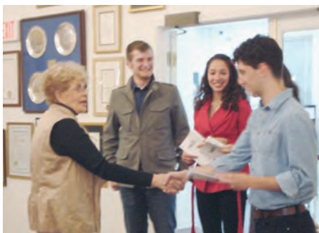
Congratulating some of the students on their beautiful artwork.