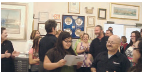
Just a few of the 130+ attendees at our first P. Buckley Moss Invitational Art Show.