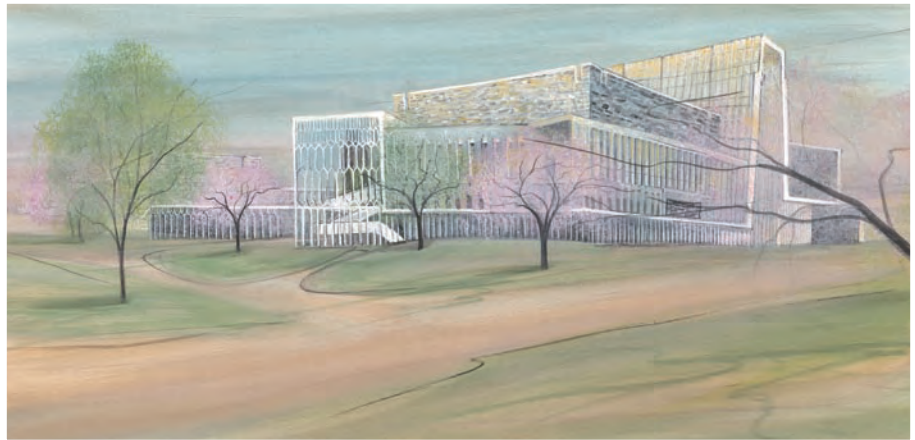
Center for the Arts at Virginia Tech Giclée on paper Edition: 5,000 and 25 artist's proofs