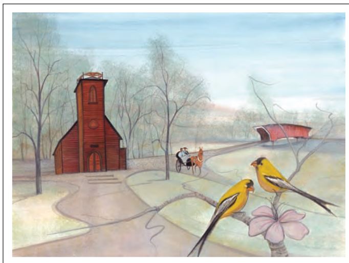
For the Love of Iowa Edition: 250

IS: 15 x 20-1/4 ins. $200 ($250 after July 21)