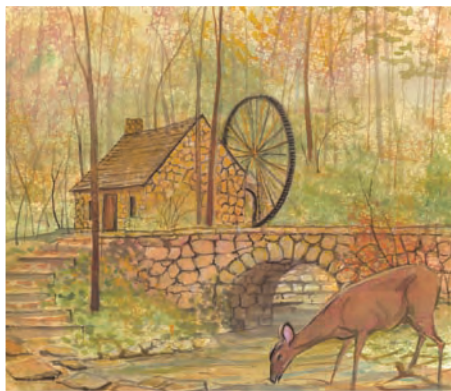
Old Mill Waterwheel IS: 9-1/2 x 11 ins., $90 Giclée on paper Edition: 250 and 25 artist's proofs