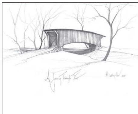
All volunteers will receive the black and white print A Journey Through Time, valued at $45, as a thank-you gift.

Volunteer and receive a complimentary black and white print! Many volunteers are needed to make the convention run smoothly. If you are interested in helping out in a friendly, low-pressure activity, please contact us at 1-800-430-1320 or e-mail to patty-moss@pbuckleymoss.com.