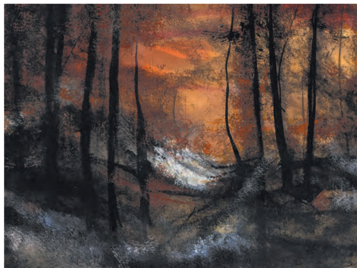
Fire and Ice Giclée on paper and canvas Edition 250 and 25 artist's proofs