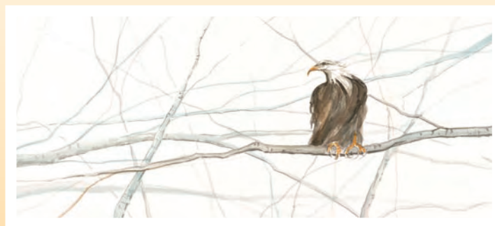
Majestic Giclée on paper Edition 250 and 25 artist's proofs