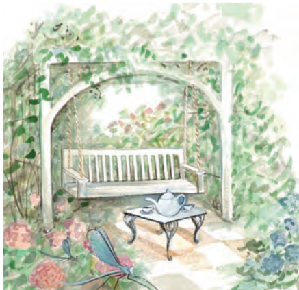
Shades of Pink IS: 10-5/8 x 11 ins., $95 Giclée on paper Edition 250 and 25 artist's proofs