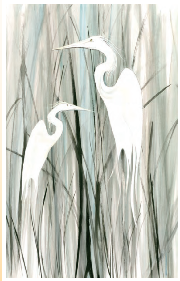
Egret Romance Small – IS: 20 x 12-11/16 ins., $200 Giclée on paper Large – IS: 40 x 25-3/8 ins., $1,000 Edition 250 and 25 artist's proofs