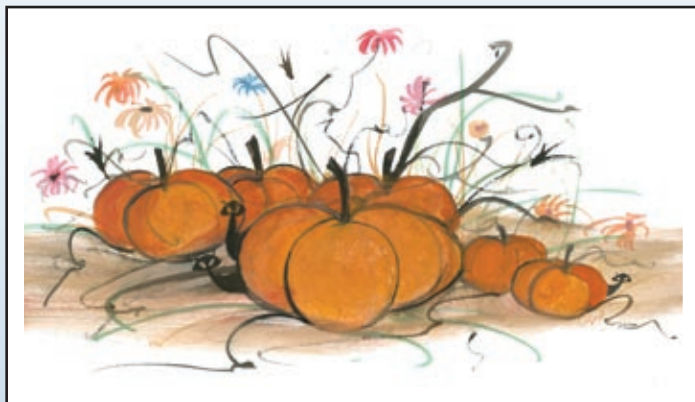
Hangin' in the Pumpkin Patch Giclee on paper Edition 250 and 25 artist's proofs