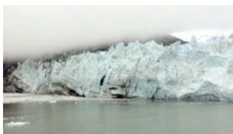
Marjorie Glacier at Glacier Bay, Alaska.