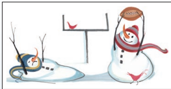
Another Maize and Blue Meltdown Giclee on paper Edition 750 and 25 artist's proofs Available December 10