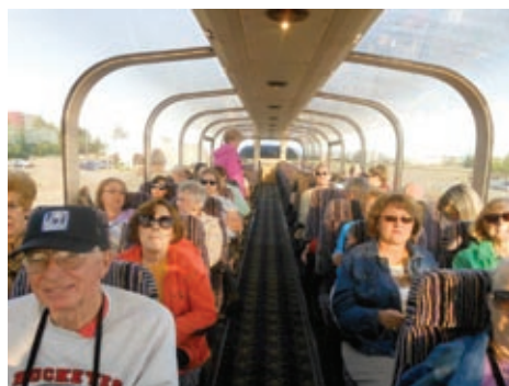
Traveling on the McKinley Explorer train through Denali.