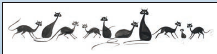
Meow 2 Giclee on paper Edition 250 and 25 artist's proofs