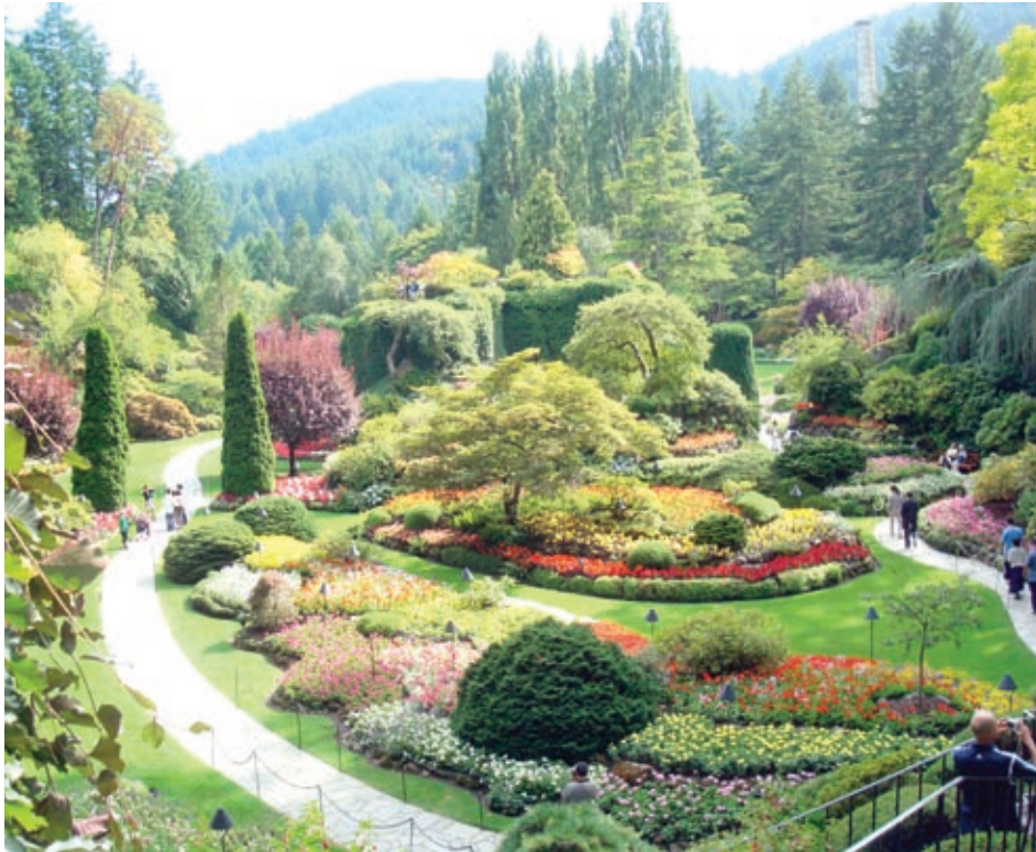
Butchart Gardens in Victoria, Canada. The gardens are breathtaking!