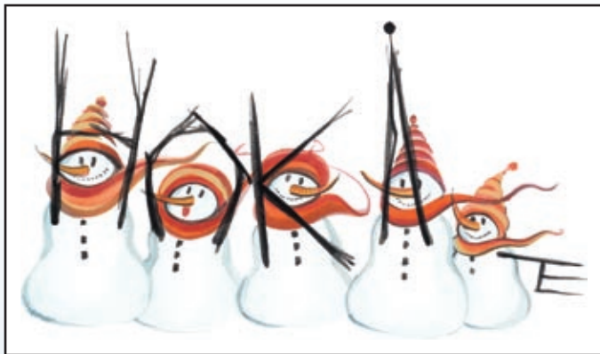
H-O-K-I-E Giclee on paper Edition 500 and 25 artist's proofs