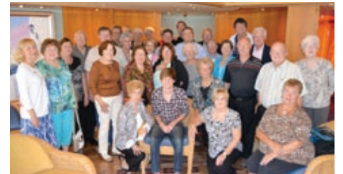
It was such fun to see amazing Alaska with so many friends!