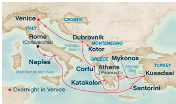
Ruby Princess from Rome to Venice July 23 rd - August 4 th