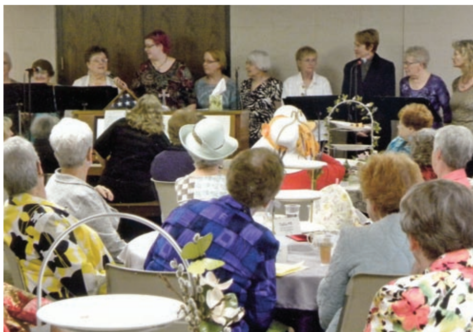
Attendees at Heart of Iowa Chapter's fundraising tea enjoyed entertainment by "The Sister Act".

THREE RIVERS MOSS Chapter (Pittsburgh, PA) obtained a remarked For the Children print from the Society's Charity Print Program and raffled it to raise funds