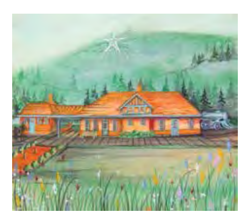
The Virginian Small, IS: 9-1/4 x 10-1/2 ins., $100. Large, IS: 14 x 16 ins., $200.

convention, raised over $7,700 for the P. Buckley Moss Foundation for Children's Education.