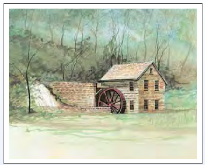
Summer's Hush Giclée on paper, Edition size 250