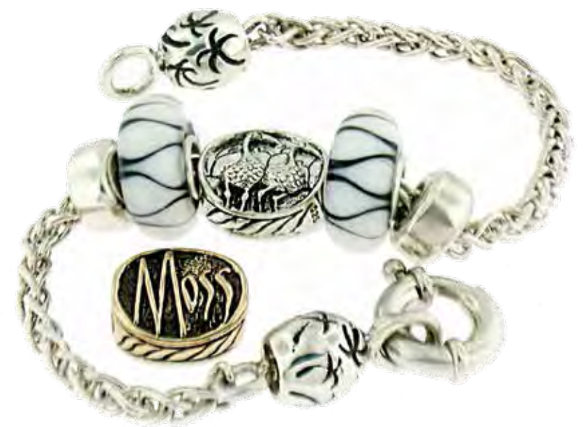
Starter bracelet includes 2 black and white glass beads and two stopper beads. The Forever Together bead comes separately with your membership. The glass beads may vary in design from those pictured above.

When ordering your bracelet, please specify your size. We offer 6.5 inches to 8.5 inches, in \frac{1}{2} inch increments. To determine your size, measure your wrist and add half an inch.