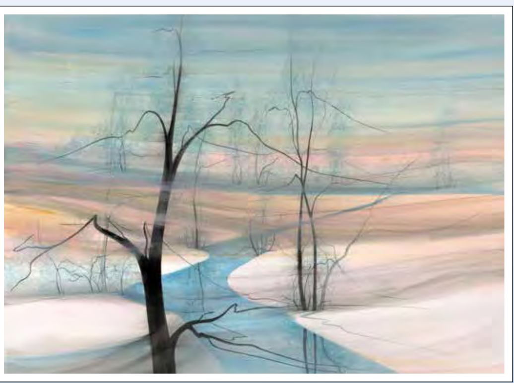
Winter's Symphony Giclée on paper, Edition size 500

IS: 14-1/2 x 19-3/4 ins., $230 IS: 22 x 30 ins., $550