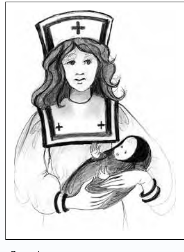
Caregiver Giclée on paper, Edition size 250 IS: 5-3/4 x 4-1/4 ins., $40