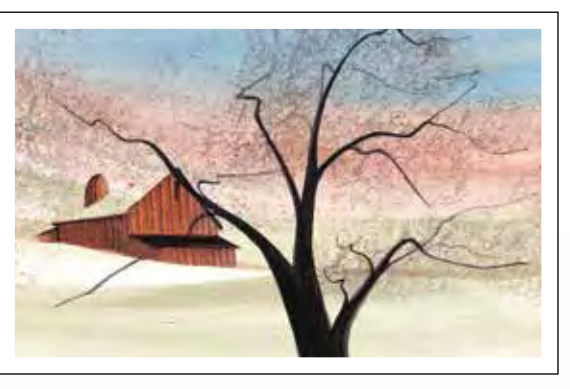
Spring's DawningIS: 4-5/8 x 7-1/4 ins., $60Giclée on paper, Edition size 500