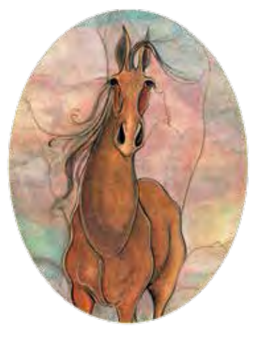
Spirit of Freedom Brooch for Adult Members

expected. The most egregious cases are of prints claimed to be by Pat when in fact they are copies or "fakes." Fortunately, these are a rare occurrence and, upon close examination, a