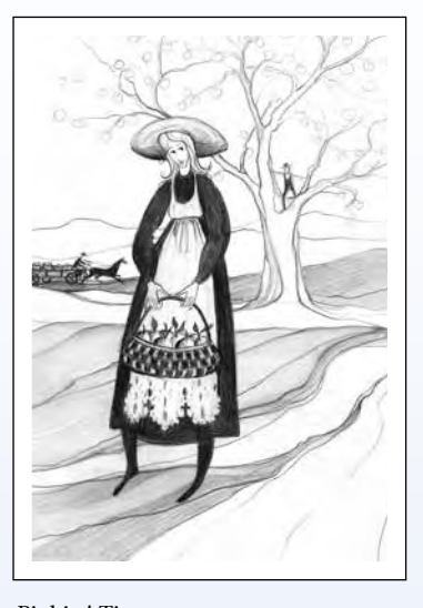
Pickin' Time Giclée on paper, Edition size 500 IS: 6-1/2 x 4-1/2 ins., $45