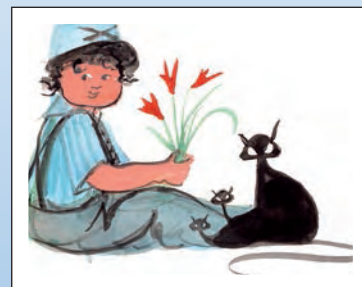
Friends & Flowers Giclée on paper Edition 250 IS: 3-1/4 x 4 ins. $45