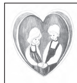
The Promise Black and White Renewal Gift Comes free with your renewal (value of $45)