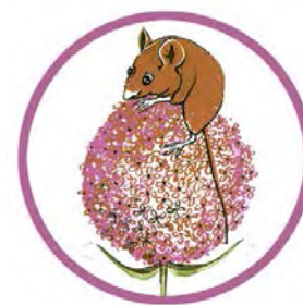
On Top of the World Brooch for Junior Members