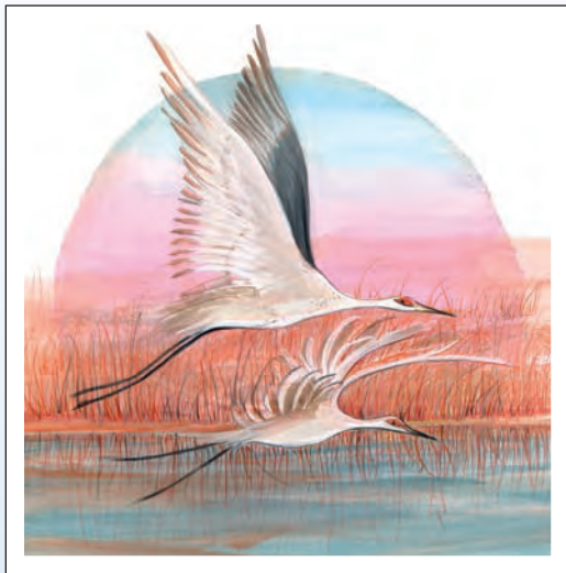
Northern Sojourn Giclée on paper Edition 50 Artist's Proofs IS: 12 x 12 ins. $250