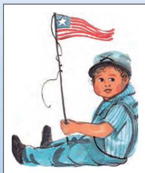
My Flag Giclée on paper Edition size 250 IS: 3-7/8 x 3-1/4 ins. $45