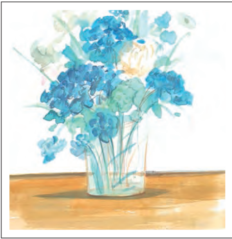
The Healing Bouquet Giclée on paper Edition 250 IS: 6 x 5-7/8 ins. $50