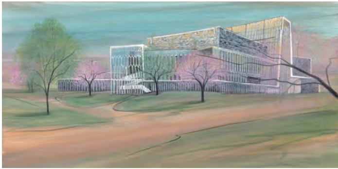
A portion of the proceeds from the sale of Center for the Arts at Virginia Tech benefits the Center.

was lucky enough to find them at a young age, and they opened up so many learning avenues and professional opportunities for me. That is why I am so excited about the impact this wonderful facility will make on thousands of people, young and old, across this entire region of our state.”