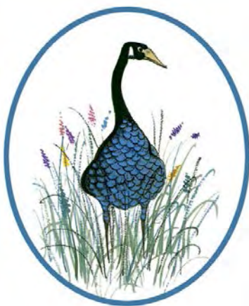
On a Summer Day Brooch for Adult Members

This year's brooch for adult members is adapted from the print On a Summer Day . As we did last year, we are making this brooch in-house and, at time of press, have begun production on it. You will be pleased to know that we are ahead of schedule this year because we have complete control over the manufacture and distribution of the brooches. The 2014 brooch for junior members is adapted from Pat's painting On Top of the World .