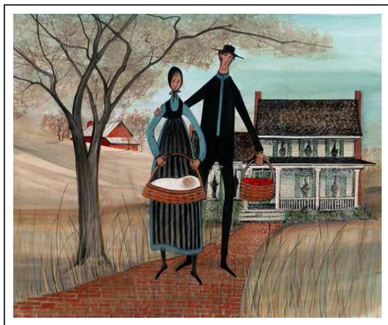
Memories of Home Adult Members-Only Print IS: 9¼ x 11¼ ins., $80

of Home deserves to take a central place in any collection of Pat's work.