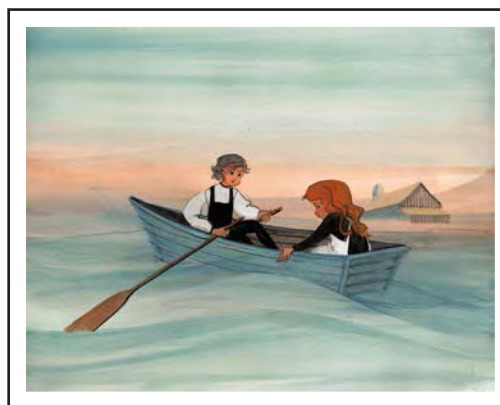
Takin' Her Out Junior Members-Only Print IS: 5 x 6½ ins., $50