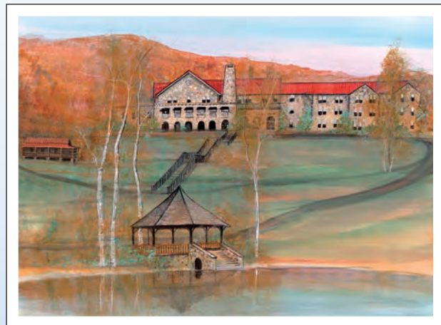
Mountain Lake Giclée on paper Edition 250 IS: 10-1/2 x 14-3/8 ins. $125