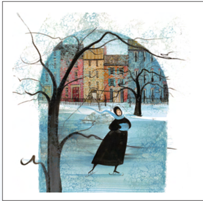
LONE SKATER $70 Giclée on Paper, Edition size 250 IS: 7-1/2 x 7-7/16 ins.