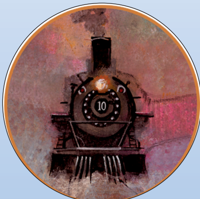
FULL STEAM AHEAD $42 Porcelain Ornament 3-5/16 ins. diameter