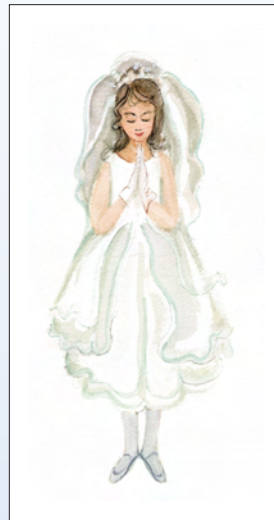
FAITH $55 Giclée on Paper, Edition size 250 IS: 8 x 3-1/2 ins.