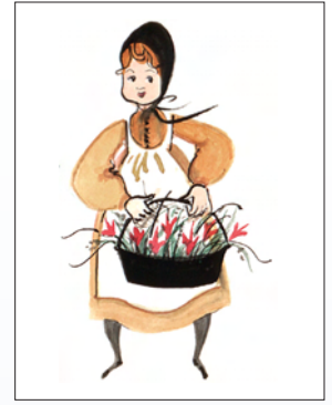
OUR GIRL $45 Giclée on Paper Edition size 250 IS: 4 x 2-7/16 ins.