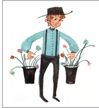
OUR BOY $45 Giclée on Paper Edition size 250 IS: 4 x 3-1/2 ins.