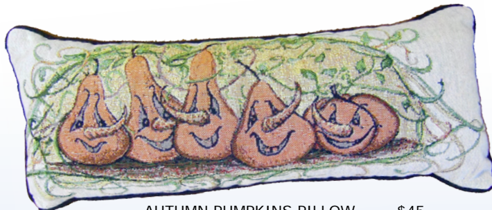
AUTUMN PUMPKINS PILLOW $45 8 X 20 ins.