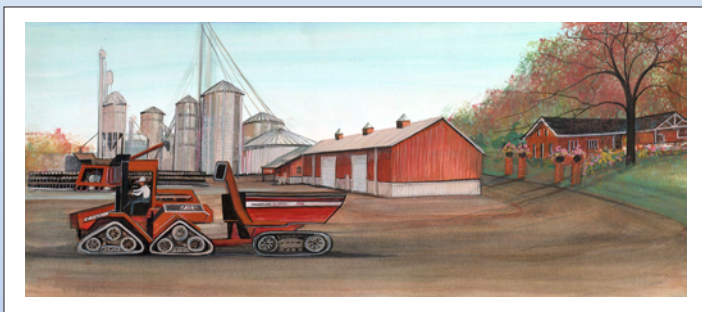
FARM AT HOME $125 Giclée on Paper, Edition size 250 IS: 7-7/8 x 19 ins.