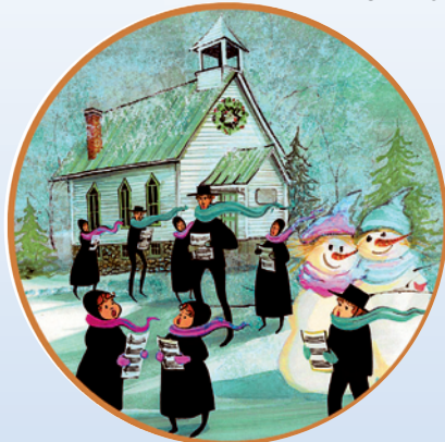
CAROLING SEASON $42 Porcelain Ornament 3-5/16 ins. diameter