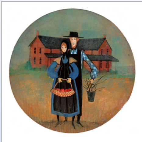
OUR HOME PLACE $70 Giclée on Paper, Edition size 250 IS: 7-13/16 x 8 ins.