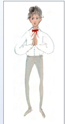
TRUST $55 Giclée on Paper, Edition size 250 IS: 8 x 3 ins.