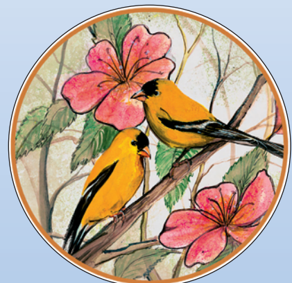
SPRING FRIENDS $42 Porcelain Ornament 3-5/16 ins. diameter