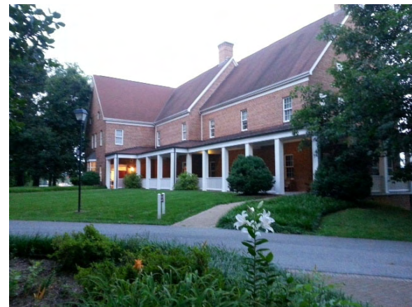
The P. Buckley Moss Museum in Waynesboro, VA, closed on July 14, 2014, after 25 wonderful years.