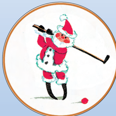
GOLFING SANTA $42 Porcelain Ornament 3-5/16 ins. diameter