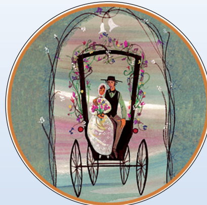
LOVE'S COMMITMENT $42 Porcelain Ornament 3-5/16 ins. diameter