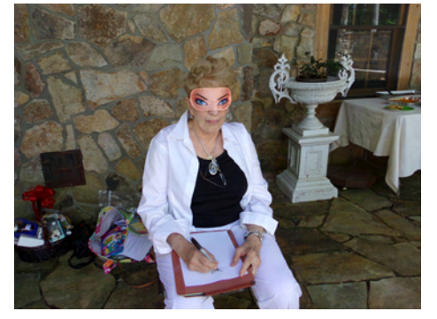
Drawing a black cat "in my sleep."

I'm settling into my new lake house in Radford and hosted a potluck lunch to help the Moss in the Valley and the Moss in the Country Chapters celebrate their respective 25th and 20th Anniversaries. We had loads of fun, especially with the games. We even had a contest to see who could draw