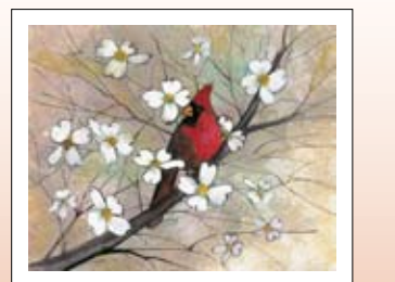
Promise of Spring $45