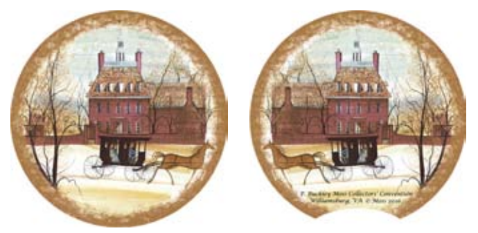
Govenor's Palace , a limited edition commemorative porcelain ornament, will be released at the convention.

This is the work-in-progress of the large convention print.