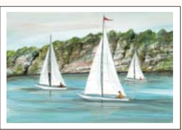
The Cliffs at the Lake IS: 8-3/4 x 13 ins. IS: 12 x 17-7/8 ins. $