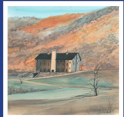
On Crooked River $75 Available August 28. IS: 8-3/4 x 8-15/16 ins.