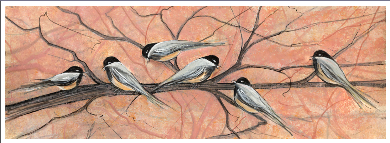
Birds of a Feather Available September 8 IS: 6-1/2 x 18-1/2 ins. IS: 9-15/16 x 28-3/8 ins.