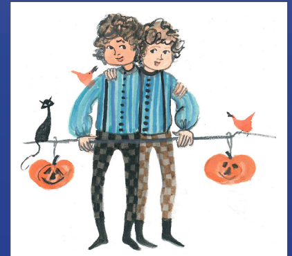
Jack-O-Lantern Twins $45 Available September 8 IS: 4-15/16 x 5-1/4 ins.