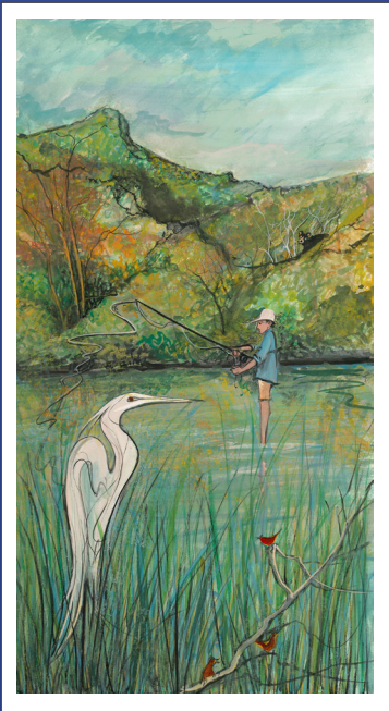
River Guardians $95 IS: 14-3/4 x 7-3/4 ins.