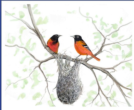
Pride of Maryland $75 IS: 8 x 10 ins.