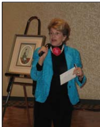
Pat announces the winners of the framing competition.