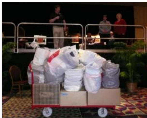
Just some of the 283 bath towels collected for the Four Oaks facility.