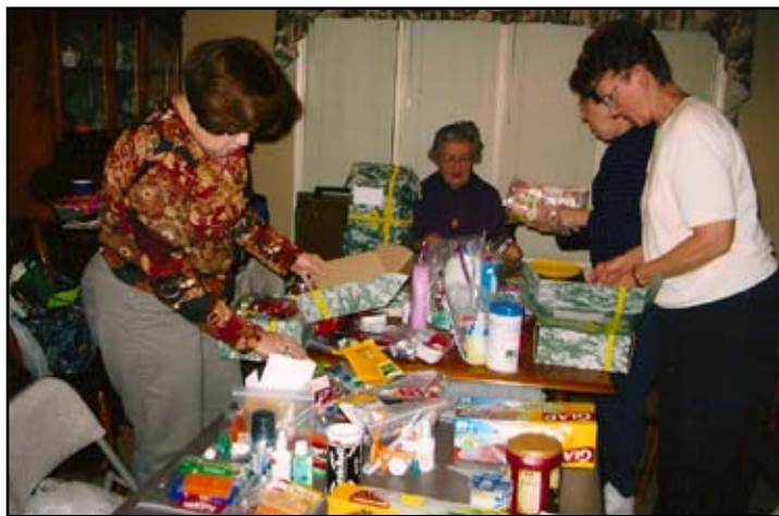
Members of Moss in the Forest chapter pack boxes of items to be sent to the military.

Commonwealth University / Medical College of Virginia Pediatric Hospital, one of whose needs is teaching stethoscopes.