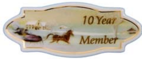
10 Year Anniversary Pin — $20