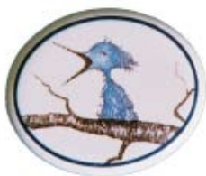
"The Fledgling" New Junior Members