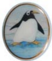
"Winter Friend" 2009 Renewal Pin