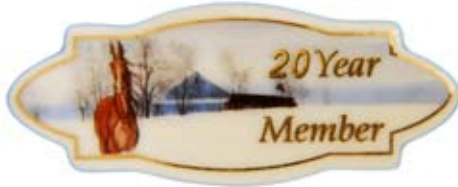
20 Year Anniversary Pin — $20