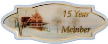
15 Year Anniversary Pin — $20