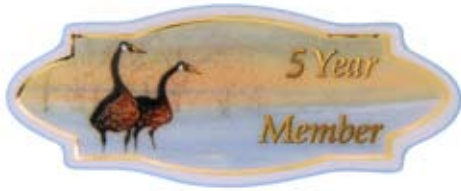
5 Year Anniversary Pin — $20