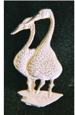
Society Pewter Geese Pin — $20