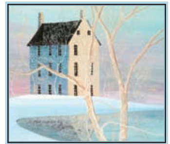
2011 Adult MOP Journey's Reward