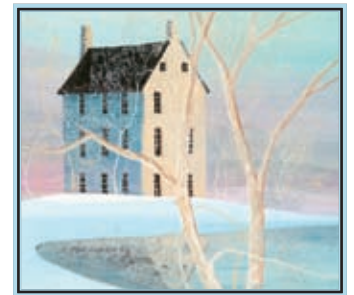
2011 Adult MOP Journey's Reward