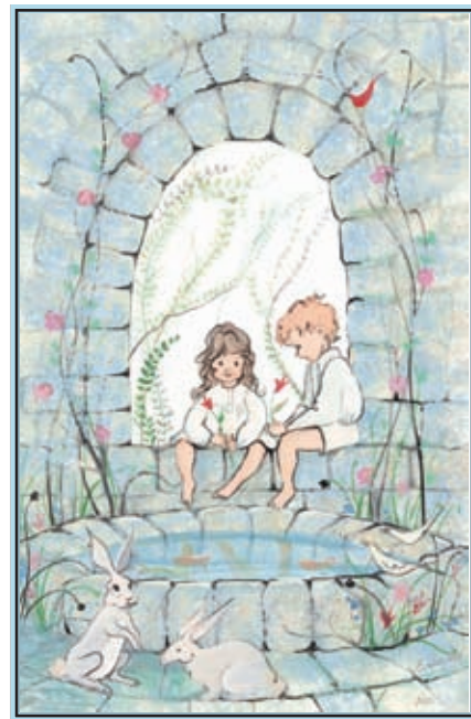
Precious Angels in My Garden, $55 2010 Junior Members-Only Print