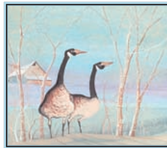
2011 Chapter Companion Print The Gatekeepers