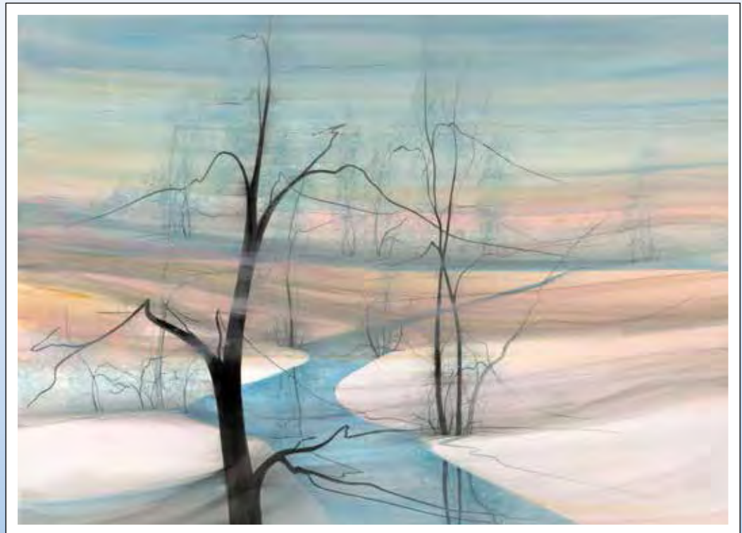
Winter's Symphony Giclée on paper, Edition size 500