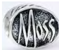
Enlarged to show detail, actual size 1/2 (w) x 3/8 (h) x 1/4 (d) ins.