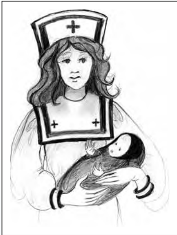
Caregiver Giclée on paper, Edition size 250 IS: 5-3/4 x 4-1/4 ins., $40