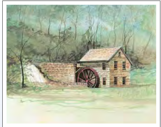
Summer's Hush IS: 10 x 12-1/2 ins., $100 Giclée on paper, Edition size 250