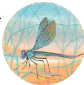
Wings of Change Brooch for Junior Members

can see to guarantee a good quality product. A benefit of doing it in-house is that in the future, we will be able to produce our pins early in the year. No more wait! We will be shipping the first of our new 2013 pins toward the end of September.