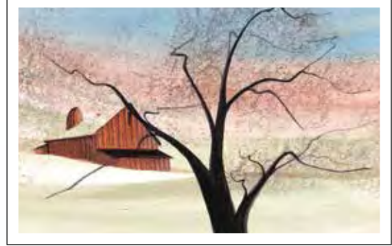
Spring's Dawning IS: 4-5/8 x 7-1/4 ins., $60 Giclée on paper, Edition size 500