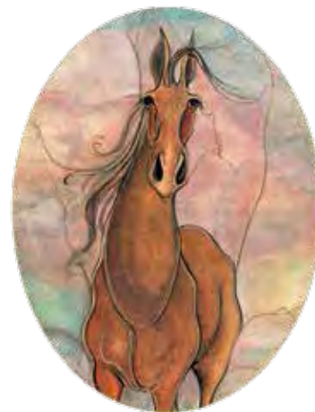
Spirit of Freedom Brooch for Adult Members