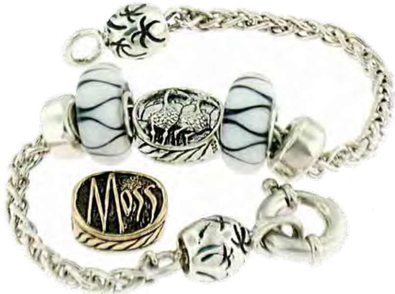
Starter bracelet includes 2 black and white glass beads and two stopper beads. The Forever Together bead comes separately with your membership. The glass beads may vary in design from those pictured above.

When ordering your bracelet, please specify your size. We offer 6.5 inches to 8.5 inches, in ½ inch increments. To determine your size, measure your wrist and add half an inch.