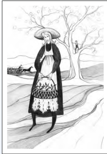
Pickin' Time Giclée on paper, Edition size 500 IS: 6-1/2 x 4-1/2 ins., $45