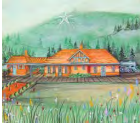
The Virginian Small, IS: 9-1/4 x 10-1/2 ins., $100. Large, IS: 14 x 16 ins., $200.

the Staten Island Rapid Transit, and it brought Pat fond memories to celebrate Roanoke's rich train history through her paintings.