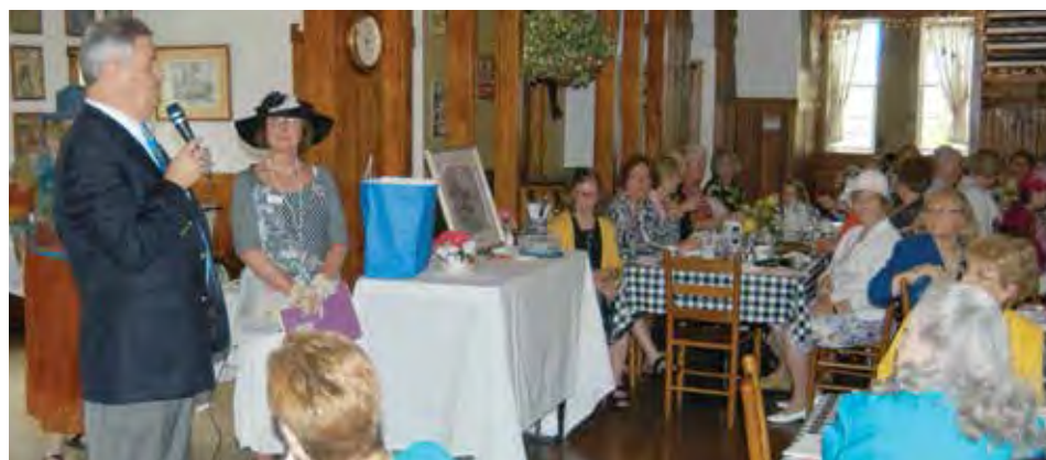
Moss on the James’ 6th Annual Tea Party at Tanglewood Ordinary in Goochland, VA.